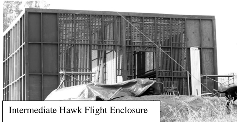
Intermediate Hawk Flight Enclosure

The intermediate hawk cage is almost finished and will be ready for young red-shouldered hawks, sharp-shinned hawks, northern harrier hawks, Cooper's hawks, falcons, and kites for the spring baby season. This project has been grueling since each individual slat had to be screwed into place every two feet. Particularly challenging was the ceiling requiring over head efforts that produced more arm fatigue than Ben Gay or massages could fix.