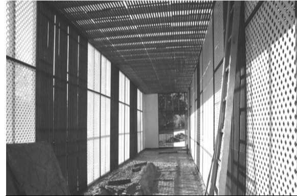
Inside of Red-Shouldered side of Intermediate Flight Enclosure