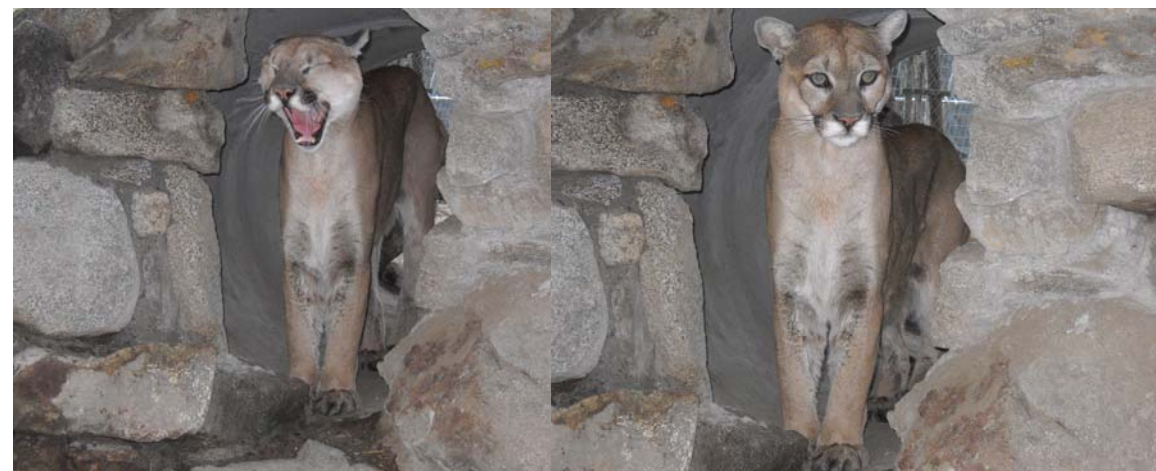
Resting on his rock platform Spotting visitors approaching

Critter Creek Chronicle Animals for Education