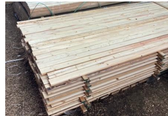
Planks drying in stacks.

Slow movement on the flight cage. We are sealing all the wood with water protective sealant. We dip each piece of lumber in a bath and stack it to dry. We rolled the sealant on the largest timbers. This is hours of work, but it is necessary before building the structure.