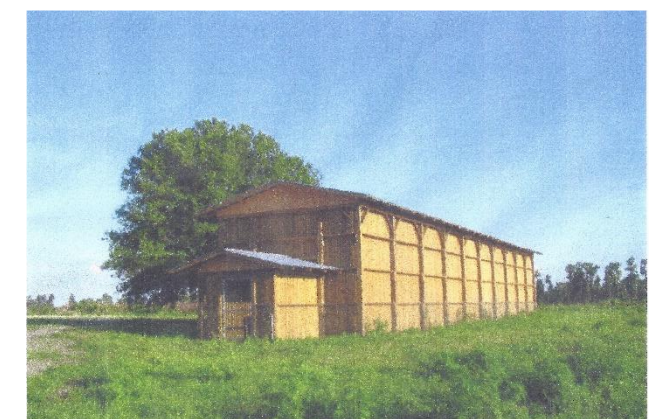
After (we hope)