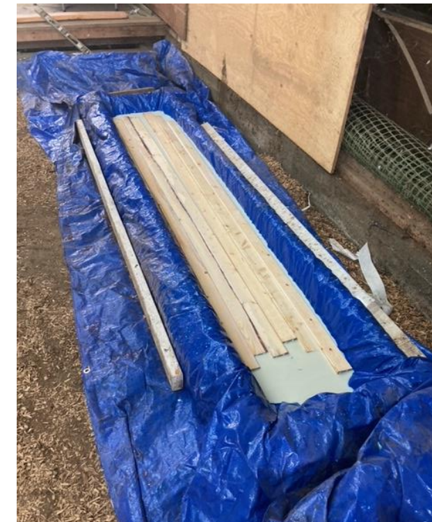
Planks in water sealant bath.