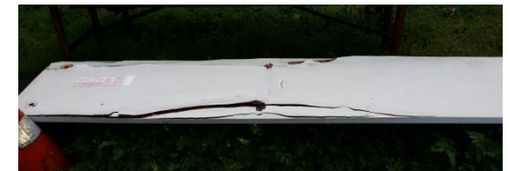
This is Tick-Tock when he was smaller and able to fit on a single wide board.