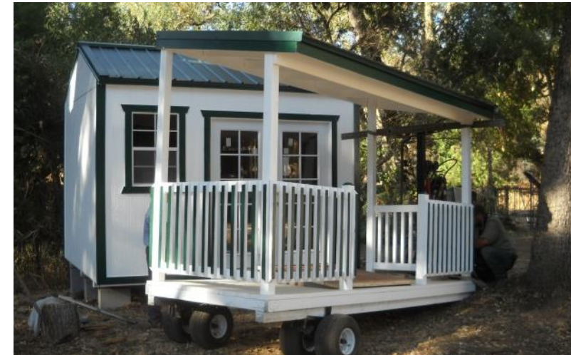
Porch being moved into position

After years of fund-raising, Critter Creek was finally able to purchase a suitable structure to serve as a gift shop. Many artists over the years have donated works to sell with the proceeds going entirely to Critter Creek. We have offered these during Silent Auctions, but we needed a place to make this artwork available at all of our events. Sept. 21st will be the grand opening. The first 25 families will receive a free wildlife coloring book with crayons. As soon as you arrive, go to the sign-in table to get a ticket that you can exchange for the book. The gift shop is located to the left of the creek bridge, so don't miss checking it out.