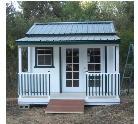
Completed Gift Shop