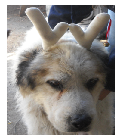
There have been strange reindeer sightings at Critter Creek

We hope you take this time to enjoy and appreciate the wildlife around you.