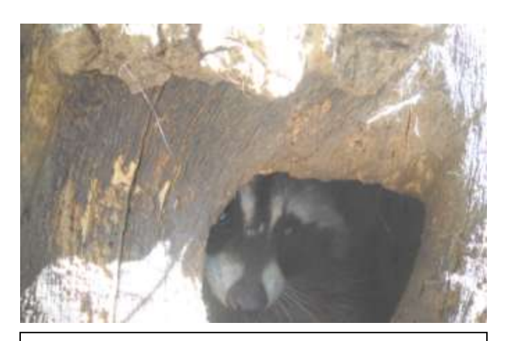
Rayne saved her exploring for the evening hours

The next day we had to make a few adjustments, but our little band of raccoons was pretty tuckered out and let us go about our work. There has been some snorting and hruphing with each other but in the end they are much more lively and active in these new surroundings.