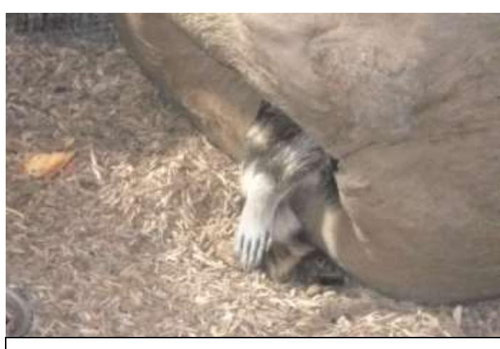
Bandit in her log after a hard day of exploration