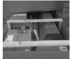
Arched Pipe segments and fittings awaiting assembly.