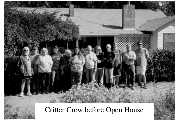
Critter Crew before Open House

Our next open house will be on Saturday, December 27 th