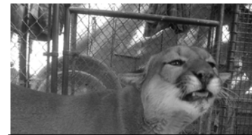
Hooray! The start of my enclosure brings a smile to my face.

After much research we finally settled on an arched pipe structure that is 60' X 38' and is strong enough to hold 9 gauge chain link (a regulation for a large cat). That order has arrived! The next step is to pour the concrete footing or curb that will prevent any underground escapes and provide a foundation for the arched rafters. Once this is completed we will cover the structure with chain link. The cost of the pipe structure has emptied the Shasta Fund. As the holiday season and end of the year approaches, we hope, despite these difficult financial times, that you will make a tax-deductible contribution to Animals for Education – Critter Creek Wildlife Station. Your money is guaranteed to be used for the care and upkeep of wildlife. We are a completely volunteer organization with no paid staff. Please join us in seeing the mountain lion enclosure through to completion.