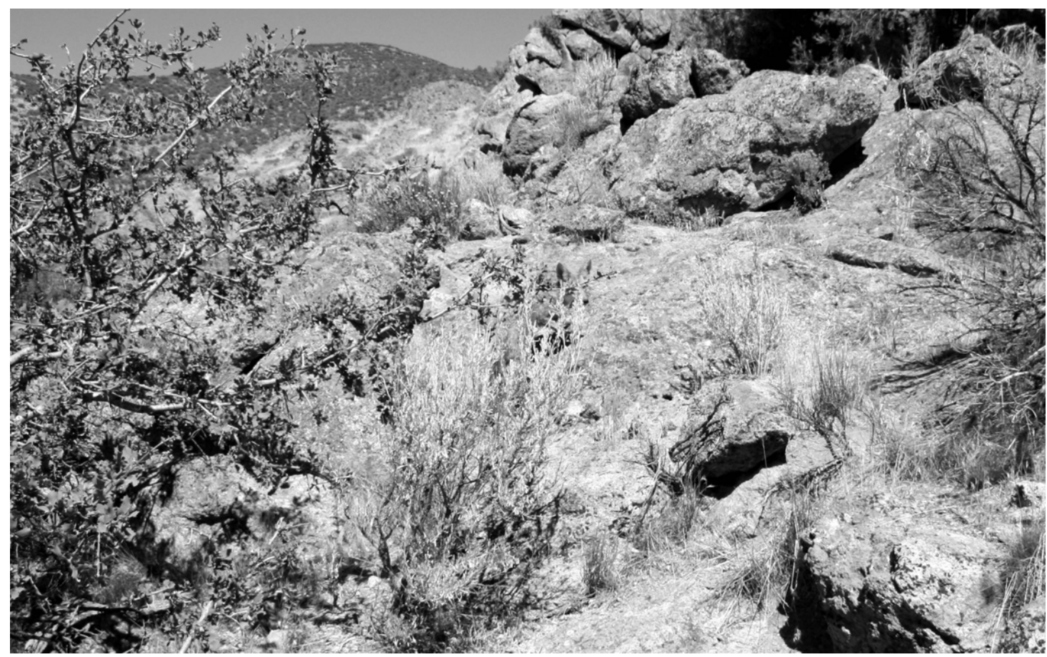
Answer is on the back page.

See if you can find the coyote in the picture below: